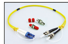
Model# LC/ST DUP LC/PC to ST/SC Adapter

OTT1442-rev03 Specifications subject to change