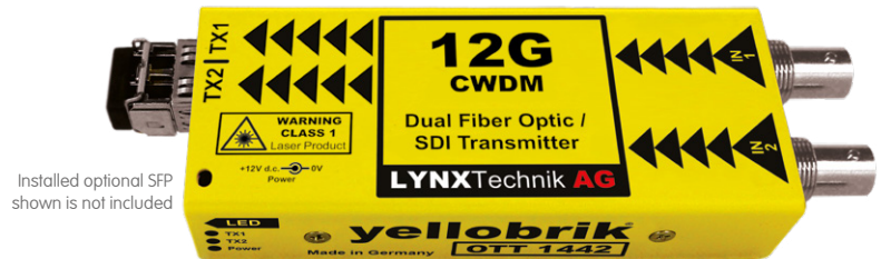
Installed optional SFP shown is not included

The OTT 1442 is a compact CWDM dual channel SDI to fiber optic transmitter designed to combat the restrictions involved with the distribution of uncompressed broadcast quality video signals over long distances. Nine pairs of wavelength choices are provided.