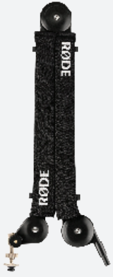
1 x PSA1+